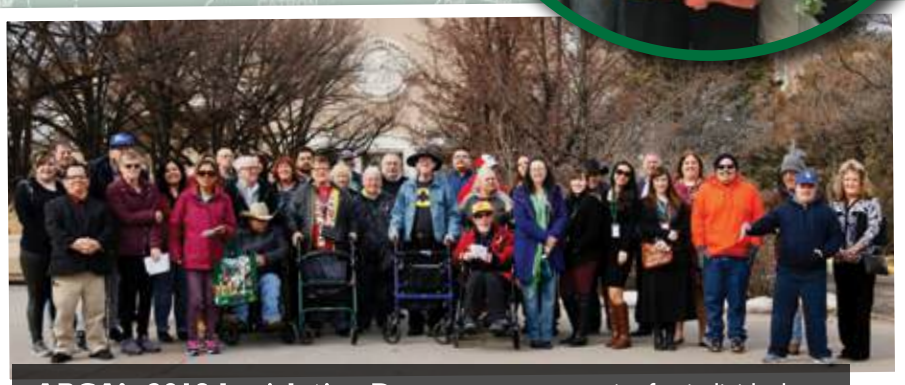
ARCA's 2019 Legislative Day was an opportunity for individuals receiving ARCA services to engage with our state leadership.