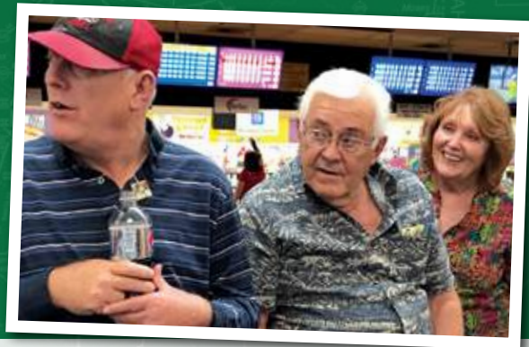
The Campbell family at our 2019 Bowl-a-Thon

ARCA's mission is working together to open doors for individuals with intellectual, developmental and cognitive disabilities to be valued members of the community.