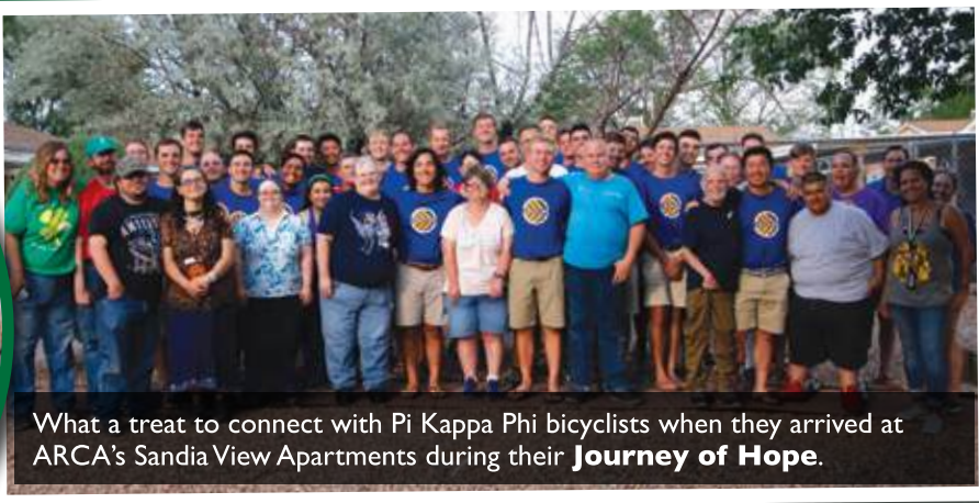
What a treat to connect with Pi Kappa Phi bicyclists when they arrived at ARCA's Sandia View Apartments during their Journey of Hope .