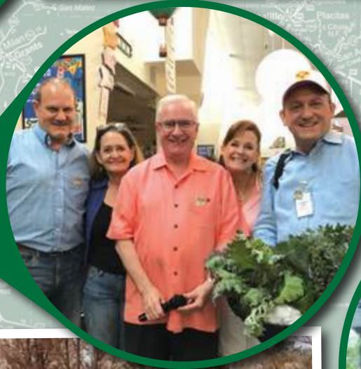
The ABQ BioPark is where it's at during ARCA Day at the Zoo! Nothing beats strolling the park with over 1,000 members of the ARCA family on a beautiful fall day.