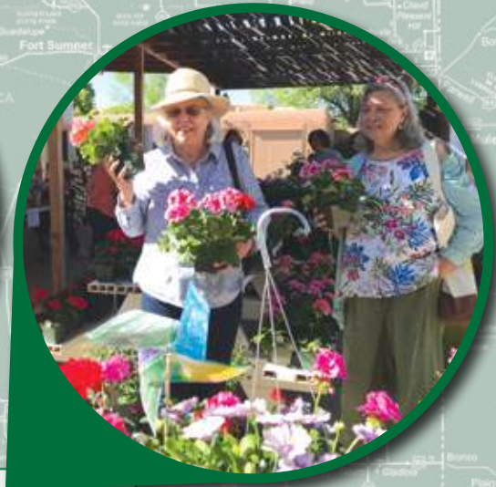
With so much color and beauty, ARCA's annual Geranium Celebration was a spirited gathering full of the hope and promise of spring.