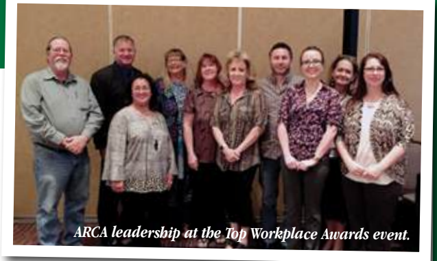
ARCA leadership at the Top Workplace Awards event.

At a public hearing held June 19, DDSD announced they intend to accept the recommendation of the report and will ask $12.5 million be included in the Governor's budget. If approved, CMS would match these funds with an additional $33.25 million (NMFMAP at 72.71%). If you would like to view PCG's preliminary rate recommendations, please visit our website at ARCAOpeningDoors.org /PCG-report. The final report