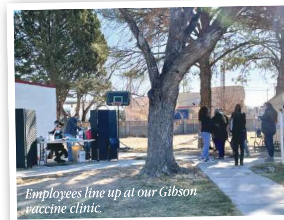
Employees line up at our Gibson vaccine clinic.

It's a new year and we're celebrating with COVID-19 vaccines. On February 17th, ARCA finished a series of in-house vaccination clinics, where 55% of employees and over 78% of individuals living in ARCA homes completed the two-dose treatment. We're continuing to practice COVID safe protocols, but hope this milestone is the first step back to spending lots of quality time with family and friends.